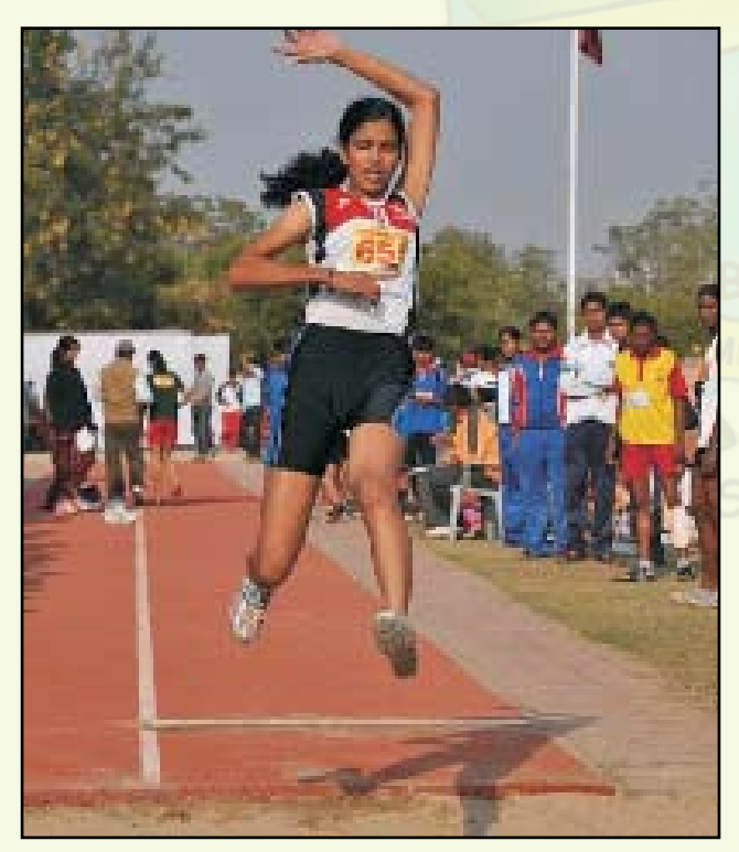
A participants taking part in Long Jump Event at CBSE National Athletic Meet, 2009 at Ryan International School, Jaipur

The Ryan International School, Jaipur organised CBSE national Athletics meet 2009-10 at Swai Man Singh stadium from 20th Dec. to 24th Dec.2009. The event hosted around