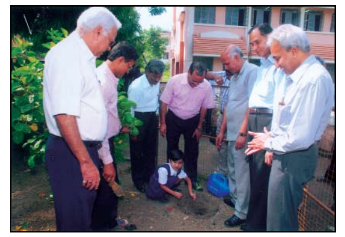
Principal, Jawahar Vidya Mandir, Ranchi encouraging a Student in Planting a Sapling during the Tree Plantation drive organised by the School