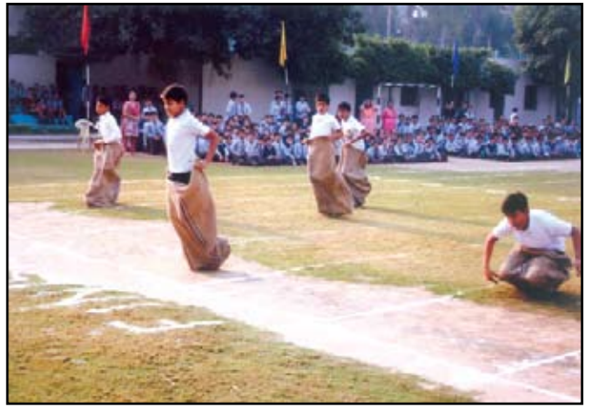
Students taking part in the Sack Race Competition at the Annual Sports Day of Rukmini Devi Public School

Quarterly bulletin of the Central Board of Secondary Education