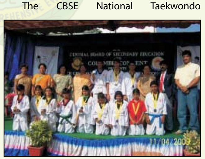
Winners of the CBSE National Level Teakwondo Championship-2009 at Columbia Convent, Indore