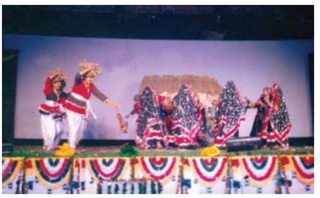
Rajasthani Folk Dance by the students at the Annual Day function of the Silver Bell School, Shamli