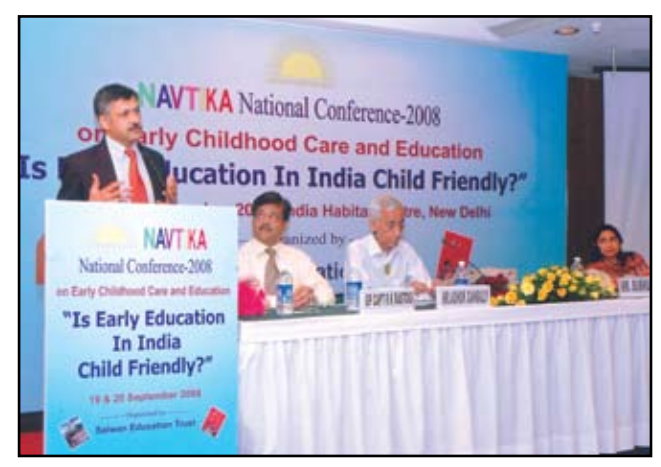
Salwan Educational Trust organized Navtika Conference on Early Childhood Care and Education in Delhi

September 2008 at India Habitat Centre, New Delhi