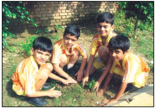
Students of Primary wing of Adharshila Vidhyapeeth, Pitampura planting a tree under Eco Club Activities

Eco Club of Aadharshila Vidyapeeth, Pitampura works tirelessly to involve students in various activities related to conservation of environment on August 15, 2008. Students of primary classes got the golden opportunity to plant saplings in the school. Students planted the tender plants and later watered them. It was an enriching first hand experience for the children.