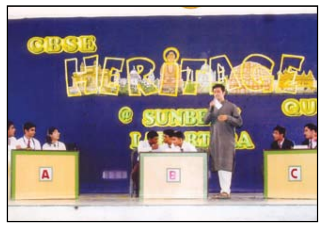
Different teams participating in Zonal round of CBSE Heritage Quiz at Sunbeam School, Varanasi

It is in the finals that Oak Grove Mussoorie stamped their supremacy by winning the quiz