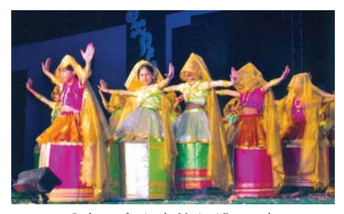
Students performing the Manipuri Dance at the Annual Day function of the Silver Bell School, Shamli