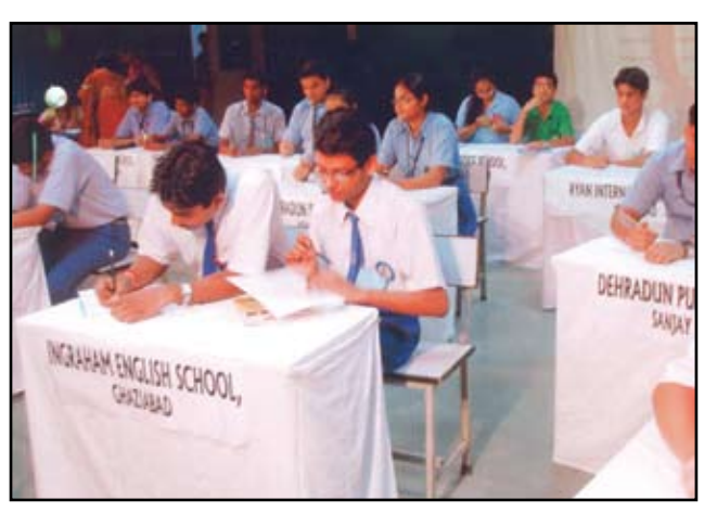
Quizard and Abhivyakti competition organised by Silver Line School, Ghaziabad

Silver Line School in association with Rotary Club Ghaziabad (Central) organized the first Inter School General Knowledge Competition (QUIZARD) and Poetry Writing Competition (ABHIVYAKTI) on 8 August 2008. The event witnessed a participation of 130 students of 18 schools from Ghaziabad and NCR. The competition was held at two levels