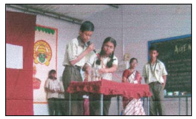
Students testing food items for adultration at Sisya School Thally Road, Hosur

Children of Class II presented a role play on Healthy Food, Unsafe Food and junk Food.