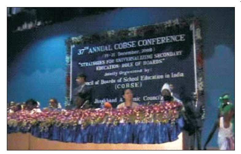
Delegates delibrating over issues related to Universalisation of Secondary Eduaction in India at the Annual Conference of Council of Boards of Education in India at Ranchi

The paper explains the context of Central Board of Secondary Education by citing its objectives as a National Board for fulfilling the educational needs of students whose parents were in transferable jobs .Thereafter the paper also explains the Academic Courses, Curriculum followed, Vocational Courses, Curricular Innovations like Communicative Approach to Language Learning, focus on 'Hands-on' activities and 'learning by doing' through practical skills in Science,