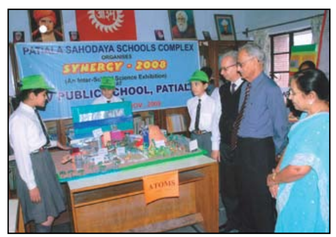
Celebration of National Education Day at DAV Public School, Patiala

Patiala Sahodaya Schools Complex organised SYNERGY-2008 – an Inter-School Science