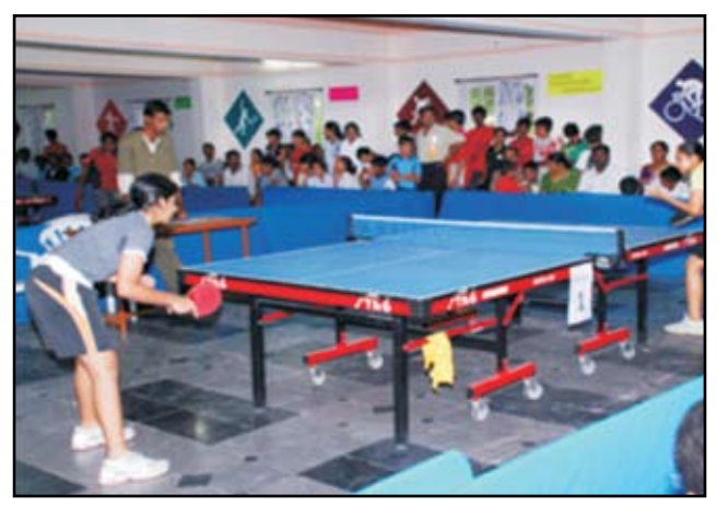
A visual from a match in CBSE Cluster VII Table Tennis Championship 2008-09 at Sri Vidyapeeth Narketpally, andhra Pradesh