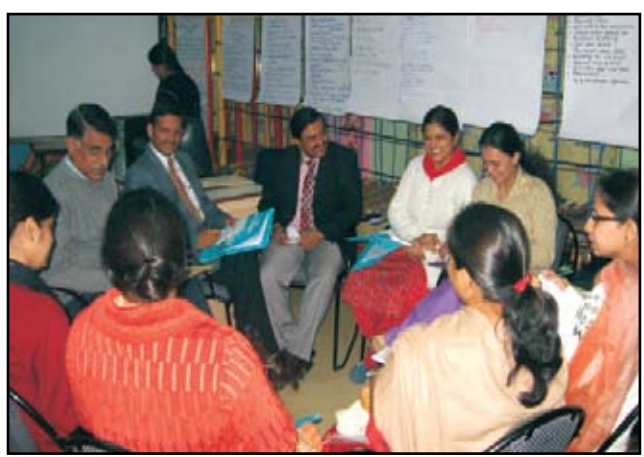
Participants discussing together in Groups during Adolescence Education Program at DPS Bareilly

A handout "IWant to Feel Good About Myself was given to complete the statements, After this, a brainstorming exercise was done.