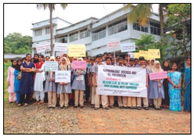
Students of AL Falah English high school Palakkad marching to spread awareness about prevention of vector borne diseases under Comprehensive Health Education Prgramme of CBSE

at home"First of all std VIII student and teachers were empowered through training to disseminate messages in source vector control campaign during the monsoon. At the school level Health Awareness Programme was organized in co-ordination with Primary Health Centre giving more emphasis on preventive measure of Chikkungunya, Dengue and Leptospirosis. Student made colourful posters highlighting the topic and visited 477 houses and distributed Pamphlets to educate people on the dangers of the diseases and suggest control measures is to be adopted.