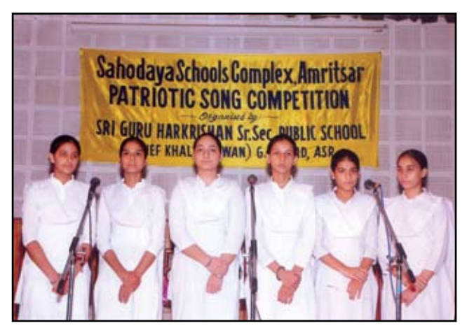
Students rendering a Patriotic Song at Sri Guru Harkrishan Sr. Sec. School, Amritsar

organized a 'Patriotic Song Competition' at Sri Guru Harkrishan Sr. Sec. Public School, G.T.