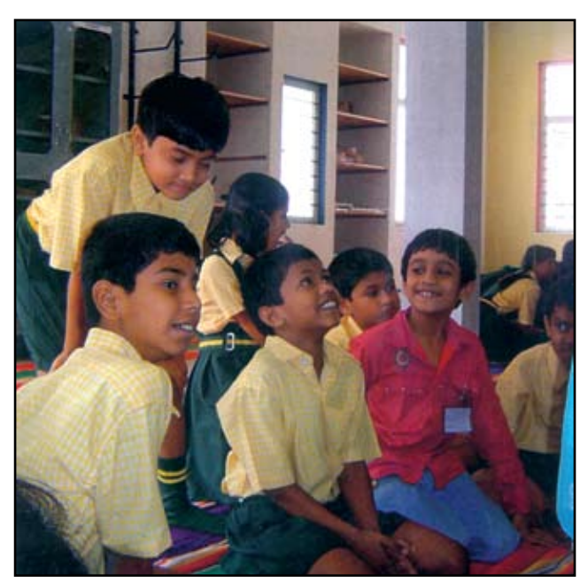
Jubiliant Children participating in an activity organised by the Health Club of Magnolia Maruti Public School, Bangalore

The "Health and Wellness Club" of A.E.C.S Magnolia Maaruti Public School, Arekere, Bangalore believing in the adage "Health is the physical, emotional, mental and spiritual well-being of an individual" carry out various activities constantly throughout the year. Age specific Personality Development courses are offered to teachers, non – teaching staff and children.