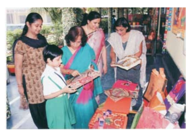
Exhibition organised by the Eco-Club of DAV Public School, Pushpanjali Enclave, Pitampura, Delhi

The creativity and environmental ethos of our primary wing students and parents were showcased in the summer vacation Eco-Club homework. Attractive articles such as folders, hanging jute bags, pen holders, and decorative items were made out of waste and recycled material by our little ambassadors of environment. The Eco-Club of the school consistently strives hard to inculcate the sensitivity towards our environment amongst the students. Accolades of appreciation and acknowledgement in the form of certificates & prizes were given to the students.