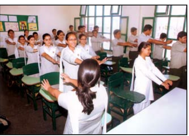
Students performing stress, releasing Asan under Yoga in Class Room at Manav Public School, Amritsar

Students now feel more physically active and mentally alert for the time they are in school. They have improved concentration levels. They have learnt proper utilization of time for self improvement.