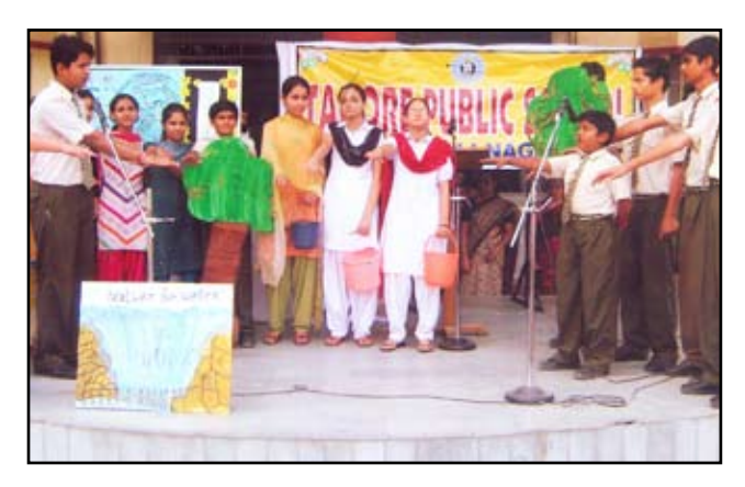
Students at Tagore Public School Jaipur performing a skit at World Population Day

Students took a pledge that they would serve humanity by encouraging sustainable