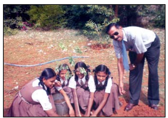
Students taking part in a Plantation Drive organised by Aditya Birla Public School, Tamilnadu

A drawing and painting competition with the titles 'Nature' and 'Save Earth' was also conducted for primary classes.