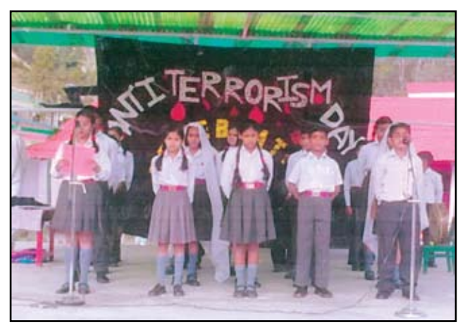
Enthusisatic students taking part in a group song at Anti Terrorism day at Army School Arunachal Pradesh

Thereafter, two minutes silence was observed to pay homage to our brave soldiers, leaders and countrymen who lost their lives fighting terrorism.