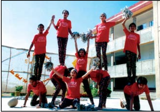
A group of girls performing an athletic feat at IRA International School