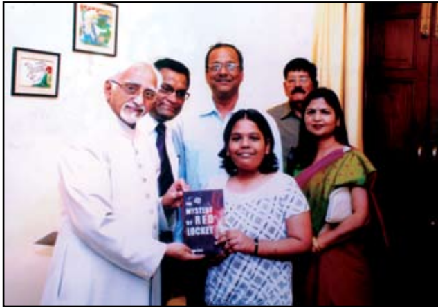
D.A.V. Public School, Faridabad student with the honourable Vice President of India at the release of the book written by her.