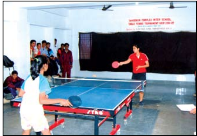
A visual from a match played in Inter School Table Tennis Tournament organised by DAV School, Chandrasekharpur