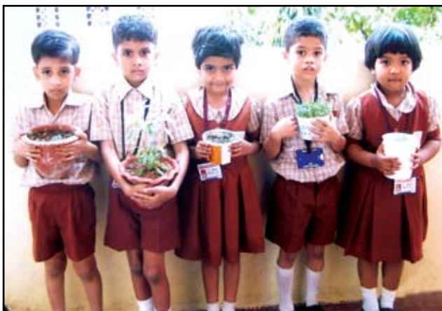
Students from Primary Section of Maharishi Vidya Mandir Sr. Sec. School Chetpet, Chennai participating in the activity Nurturing Nature

Chennai, recently conducted a Plantation Drive. The aim of the programme was to spread awareness about the exploitation of natural resources and ways of replenishing them.