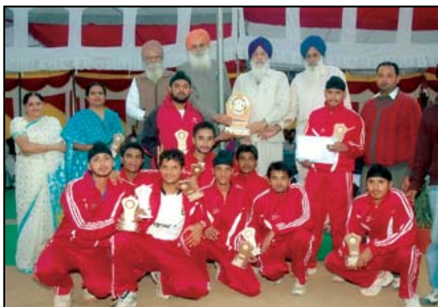
Principals and Chief guest with the under nineteen winning team, (DAV Jalandhar)

Nankana Sahib Public School , Gill Park Ludhiana hosted the CBSE National Hand-Ball Championship from Nov 27th 2008 to Nov 30th 2008 in which 480 participants from 37 schools from different states of India participated . All the teams from five zones were divided into 3 pools of Boys and Girls. Teams competed under these three pools for the championship trophy. Championship was played on league basis and HFI Rules were strictly followed. The host school provided the best possible comfort to all