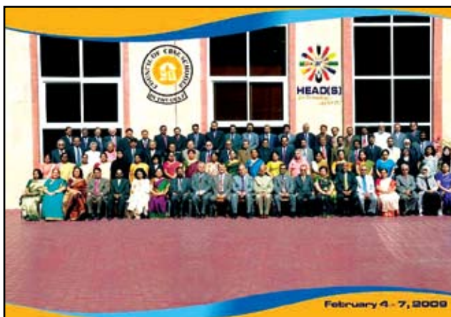
Delegates at Twenty First Conference of Dubai Sahodaya Complex