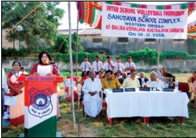
Inaugural function of Sahodaya Inter School Complex, Western Orissa