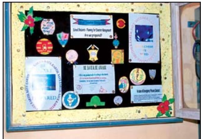
Logos prepared by the students in Logo Making Competition

On the occasion of 'Earth Day' at S.S.D.P.S, a chart making competition was organized. The students by writing poems, articles and captions, highlighted the need to protect mother earth. A 'Logo making' competition was also organised on the topic 'Be prepared Be aware' which brought awareness among students regarding disaster management. Moving ahead in the same direction the school has also inbuilt water harvesting system to augment the water resources.