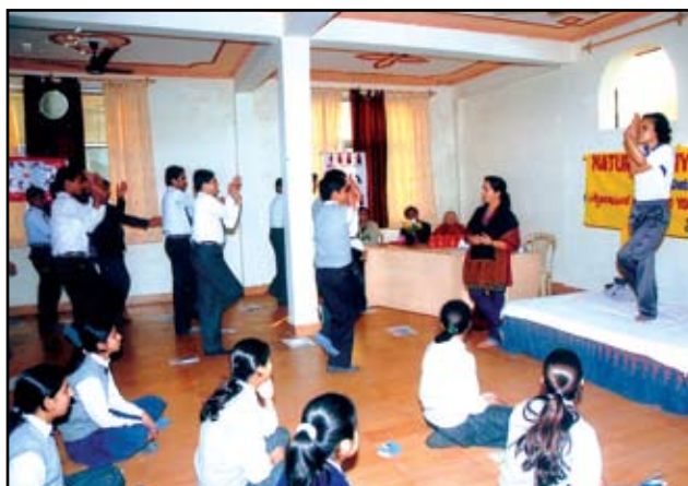
Students trying to learn diferent Asans at Naturopathy training wotkshop