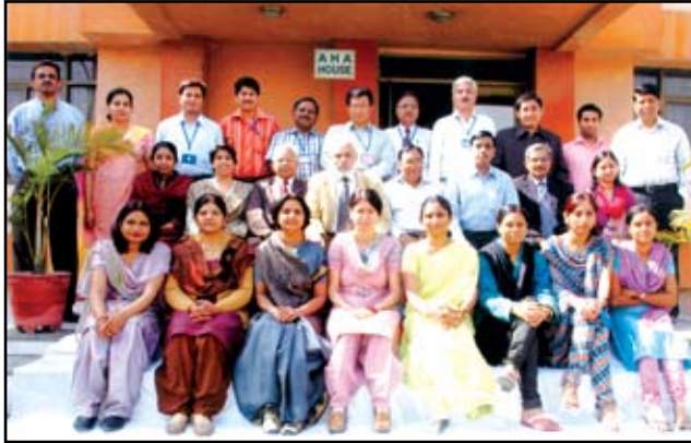
Teachers at Orientation Programme for Teachers for Healthcare Sciences organised by CBSE

Care Organization and Medical Equipment; Food and Nutrition and Dietetics are already published by CBSE.