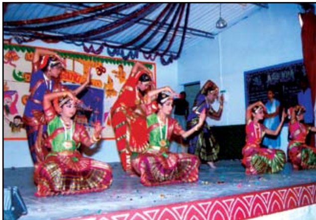
Dance Competition at Shisya School, Hosur