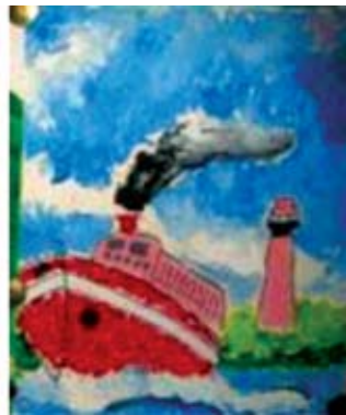
Some of the Paintings exhibited on Painting Exhibition in Convent of Jesus & Mary