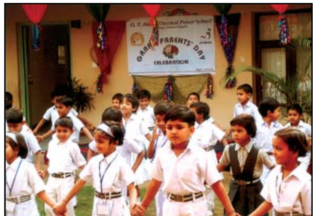
नसरी कक्षा के नन्हें-मुन्ने छात्र ग्रैंड पेरेंट्स दिवस पर एक प्रस्तुति देते हुए