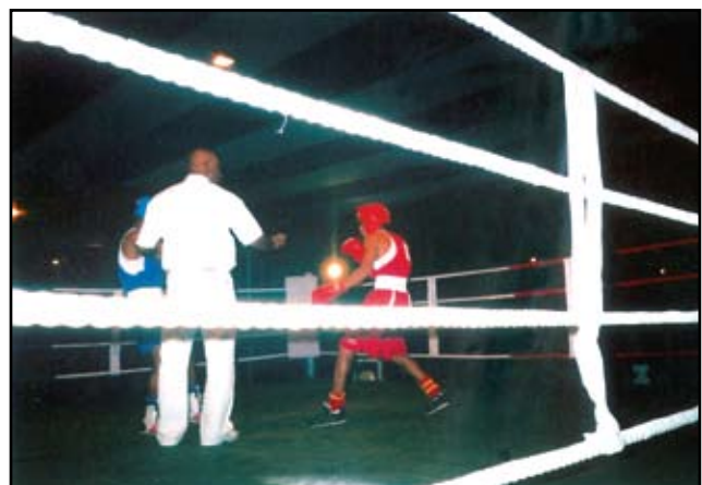
A still shot from 24th Men's Sub Junior National Boxing Championship