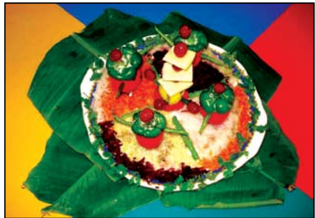
A beautifully garnished Salad Sample displayed during Salad Making Competition at Aditya Birla Public School, Veraval, Gujarat

An Inter-House Salad Making Competition was organized for the students of classes VIII and IX. The objective behind the competition was to inculcate healthy food habits and awareness regarding the choice of food among the youth. Each House was represented by four members. Cleanliness, safety, taste and presentation were the basic criterion for the judgment. The participants' creativity was revealed through the beautiful designs and patterns formed with different mouth watering salad.