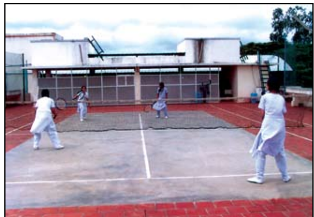
A Lawn Tennis match being played at Maharishi Vidya Mandir, Chennai

Maharishi Vidya Mandir , Chetpet, Chennai, provided ample opportunity to all its students to participate in the Games such as Cricket, Tennis, Basket Ball, Volley Ball, Shuttle, Tennis and the indoor games like Carom, Chess etc. Children always look forward for their P.H.E. classes with great interest. Mass P.T. Drills for K.G. and Primary classes are also conducted on routine basis. Inter house, inter school, inhouse competitions and field trips boosts the self esteem of the children. Skating, Dance,