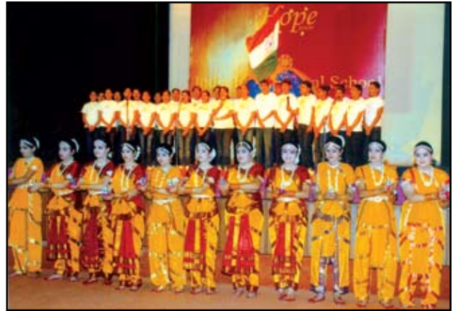
Students performing a group activity in a cultural programme 'Hope' at India International School, Jaipur

India International School, Jaipur organised a cultural programme named 'HOPE 2009' for the parents on 18th January, 2009. The programme took the audience on a journey