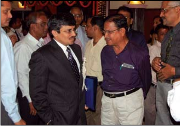
Shri Vineet Joshi, Chairman and Secretary, CBSE, interacting with Principals at the inauguration ceremony of CBSE's Regional Office Bhubaneswar

on which the edifice of schooling is being built today. There is an increasing demand for good schools. The need for quality in school education cuts across class and caste. Hon'ble Minister urged the schools assembled there to promote quality initiatives in the area of academics as well as go beyond to develop the holistic personality of the child. Health of children remains a primary concern and therefore the CBSE has launched a nation wide ' comprehensive School Health Programme '. The schools need to integrate these components in their larger curriculum to ensure the health of young people and the future generation.