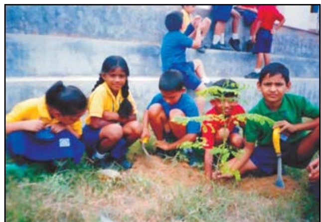
Students participating in Green Week at Eklavya School, Jalandhar

Encouraged by this information, all the classes are now maintaining a Recycle basket and a Bin Paper basket. The papers which are