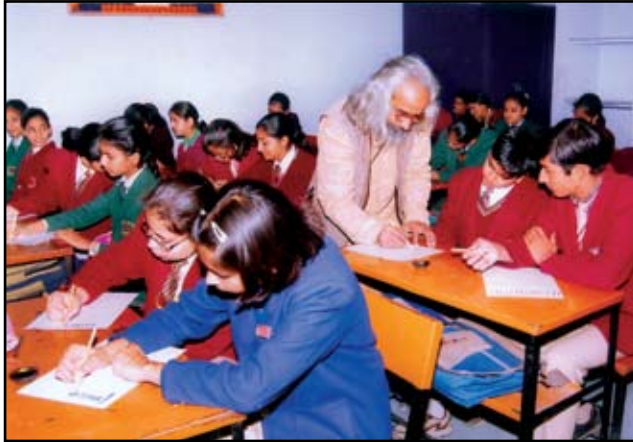
Students attending Calligraphy workshop organised by Alwar Sahodaya Complex