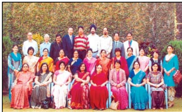
Group of participating principals with Programme Director at Third Training Programme for Principals at IIM, Bangalore