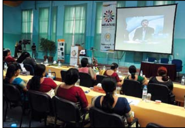
Principals interacting with Shri Vineet Joshi, CM and Secretary, CBSE through Video Conferencing mode

The 21st Conference of the Council of CBSE affiliated Schools in the Gulf was