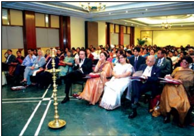
Delegates from across the country at the launch of USSI