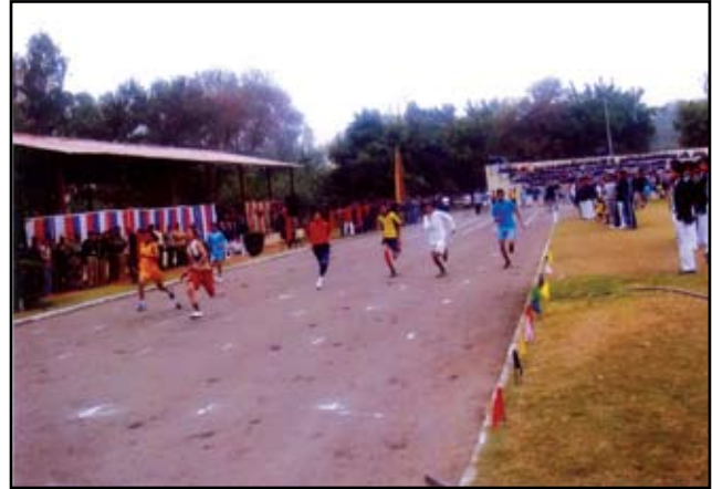
Athletic meet organised by Jammu Sahodaya Complex