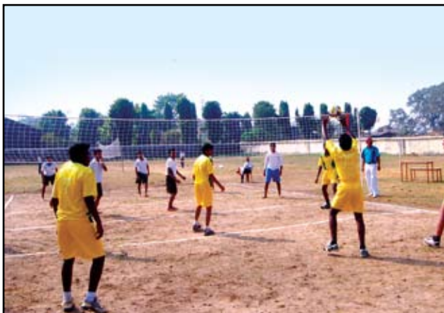
A volleyball match being played at Nagarajuna Vidya Niketan under Bangalore Sahodaya Complex

The Bangalore Sahodaya Schools' Complex organized Volleyball (boys) and Throw ball (girls) tournament on 3rd Nov-08 at BVB Nagarajuna Vidya Niketan. 16 schools for throw ball (girls) and 13 schools for volleyball (boys) from different schools participated. Sri Devaraj Urs International Residential School became the winners in Volleyball and the girls became the runners-