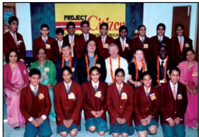
Group photograph of students carrying Project citizen at Red Roses Public School, Project Citizen