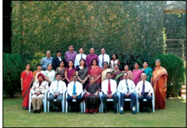
Group of participating principals with Programme Director at Fourth Training Programme for Principals at IIM, Bangalore

The programme mainly included interactive sessions on educational management, leadership styles, institution building, institutional evaluation, Performance appraisal and strategies for effective school management and the role of Principals as people managers. The faculty members from IIM Bangalore and other eminent