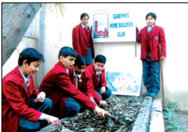
Students processing dead leaves to prepare compost at Red Roses Public School, Saket

40 students of class VII who participated in the project, were taken to the specially prepared site in the school premises where