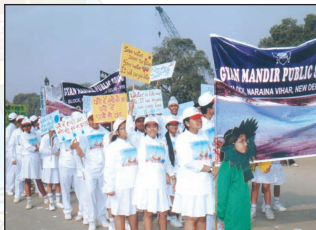
Students of Gyan Mandir Public School taking out an Environment Awareness Rally