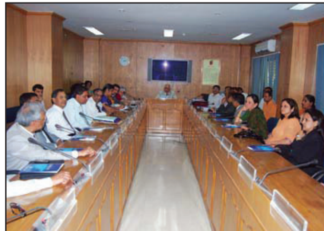
Honourable HRD Minister Shri Kapil Sibal addressing the principals