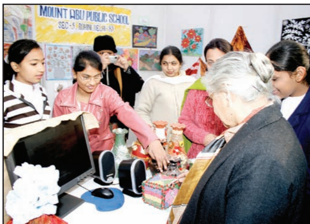
Students of Mount Abu Public School Rohini, showcasing some environmental friendly articles

a small skit highlighting the conservation of natural resources and showing the way how humans can play a significant role in saving the environment. The students were highly appreciated for showing their deep concern to environmental issues.