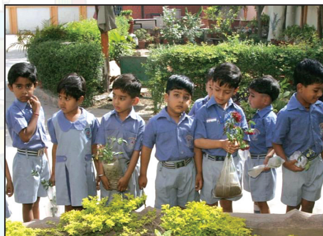
Students on the Primary Sections of Modern Public School during a procession to bring out awareness on Global warming

Walk against global warming on 24th October (International Climate Action Day) to promote the concept of Green Delhi was also taken out.