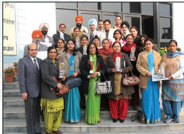
Staff Members of St Stephen's School Togan after receiving award for conserving water.

On Friday, January 23, 2010, National Environment Awareness Campaign (NEAC), organized a guidance workshop on "Climate Change" at PSCTC office, Sector 26, Chandigarh. The PSCTC presented awards to top ten schools of Punjab, out of which St. Stephen's School, Togan was ranked 7th and also received a special award for outstanding work pertaining to Water Parameters. The School has its own Sewage Treatment Plant (STP) for water conservation.