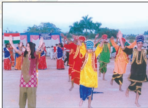
Inaugural Ceremony of Annual Sports Day at DAV Centenary Public School, Jhajjar