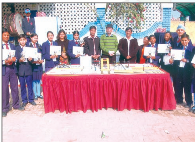
Students of Y.S. School, Barnala with trophy they won at First Lego League Championship

FLL is an international program for 9 to 16 year-old children, created in a partnership between FIRST and The LEGO Group in 1998 based on their common belief that fun and learning go hand-in-hand, and that an inspired mind can accomplish anything. More than 40 students participated from various schools in the first (northern) chapter of the First Lego league competition. Combined team of St. Johns School Chandigarh and St. Columbus School Delhi bagged the maximum points for Robotic Design and Technician in the competition. Young Scholar School (Barnala, Punjab) won the prize for the project