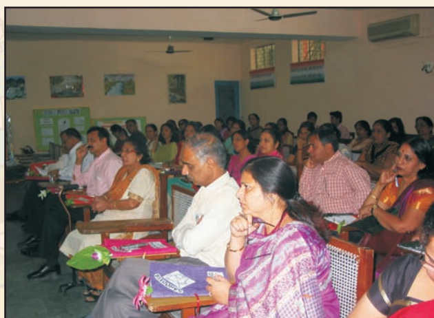
Delegates at the launch of South Delhi chapter of Sahodaya School Complex