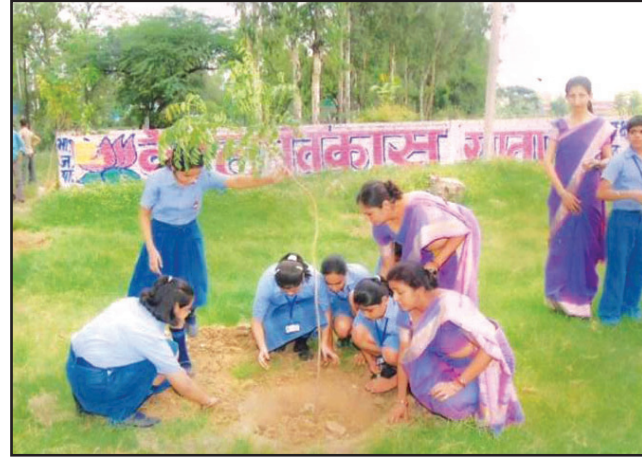
Students of Gurukul the School Gaziabad planting trees on the occasion of Vanmahotsava

our locality as to how trees are important to us. Trees help combat pollution. Protest when you see a tree being axed. Plant a tree but remember that your responsibility does not finish there. Build a tree guard, water and nurture the sapling till it grows into a tree.