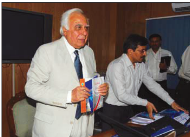
Shri Kapil Sibal Union Minister for HRD with the Flyer on CBSE-i Shri Vineet Joshi, CM CBSE can also be seen

will not be examinable and will be present as optional areas.