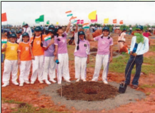
Students of Delhi Public School Bhopal planting saplings during a Plantation Drive

In an endeavor to improve the quality of life, DAV Public School, Pushpanjali Enclave , hosted an exhibition "Expo-2010, Green Huggers-Friends of Earth" on Saturday the 23rd of January, 2010. The DAV Pushpanjali Enclave family pledged to work proactively to reduce environmental pollution through environment management and saving energy. By being Eco-friendly and promoting the use of Eco friendly material everybody can contribute in controlling Global Warming.