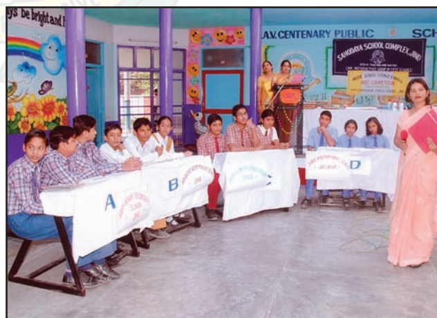
Students from different schools participating in a quiz organised by SSC Jind.

To promote esprit de corps among CBSE Schools in the Jind district, 15 schools synergized to commission Sahodaya Complex Jind. The principals of the member schools