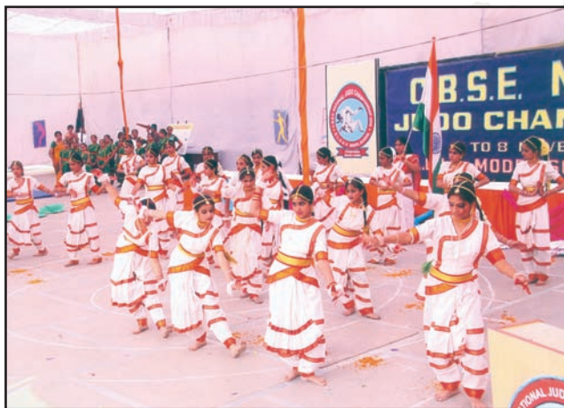
Students presenting a dance performance at the Inauguration Ceremony of CBSE National Judo Championship at DLDAVMS, Pitampura