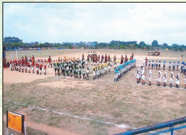
Students at Sishya School, Hosur, taking part in various sports events at the occasion of Junior Sports Day

The Junior Sports Day of Sishya School was held on 9th January 2010 at Andhivadi Stadium. The game "Bead Picking" for the UKG section saw the little ones stretching their body to maximum. The "Hop on" game witnessed the tiny tots doing their best to the pull the opponents' tail. On the whole, the event filled little ones with joy and happiness.