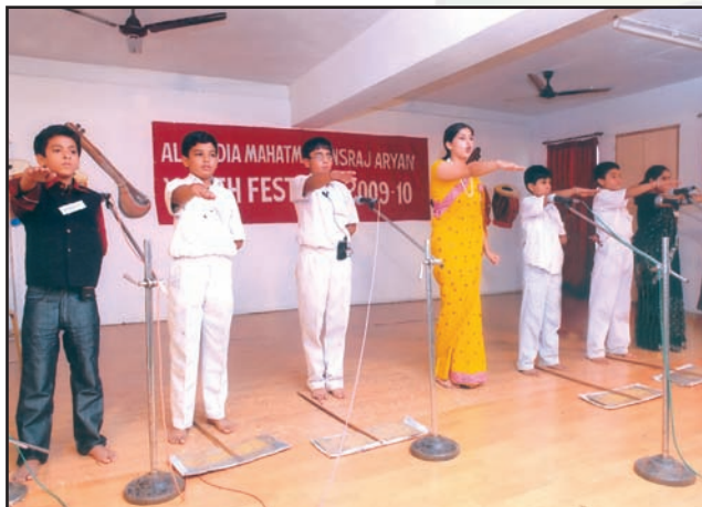
Students taking pledge to practice Environmental friendly practices at DAV Public School Khanna