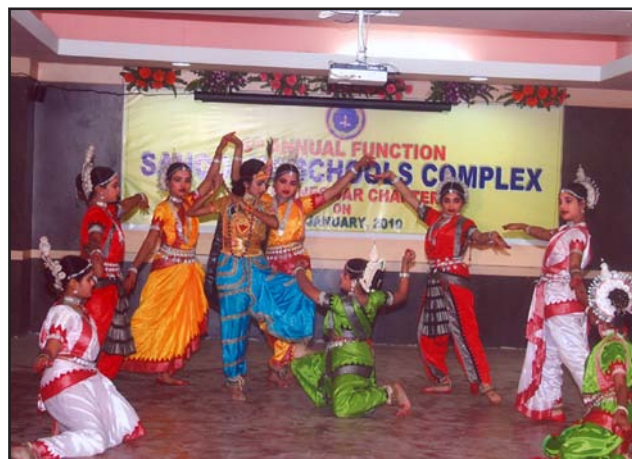
Students presenting a group dance at the annual function of SSC Bhubaneswar