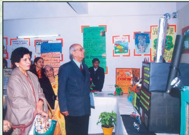
Visitors looking at various exhibits in Expo 2010 at DAV Public School, Pitampura